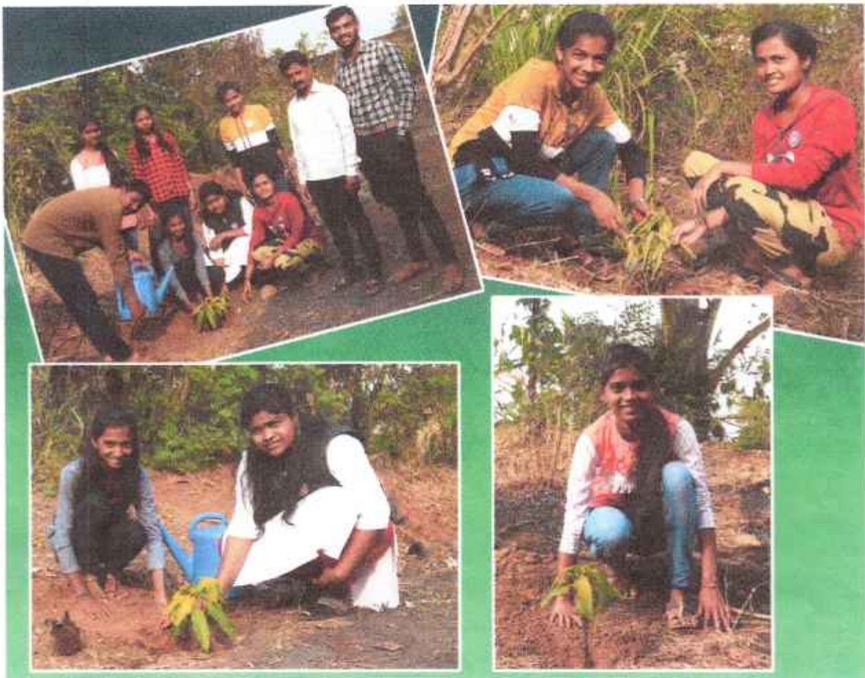
Caption: Some photographs during Tree Plantation at Vidyamandir Chandre.