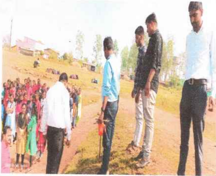
Caption - Some photographs of the Tree Plantation Event