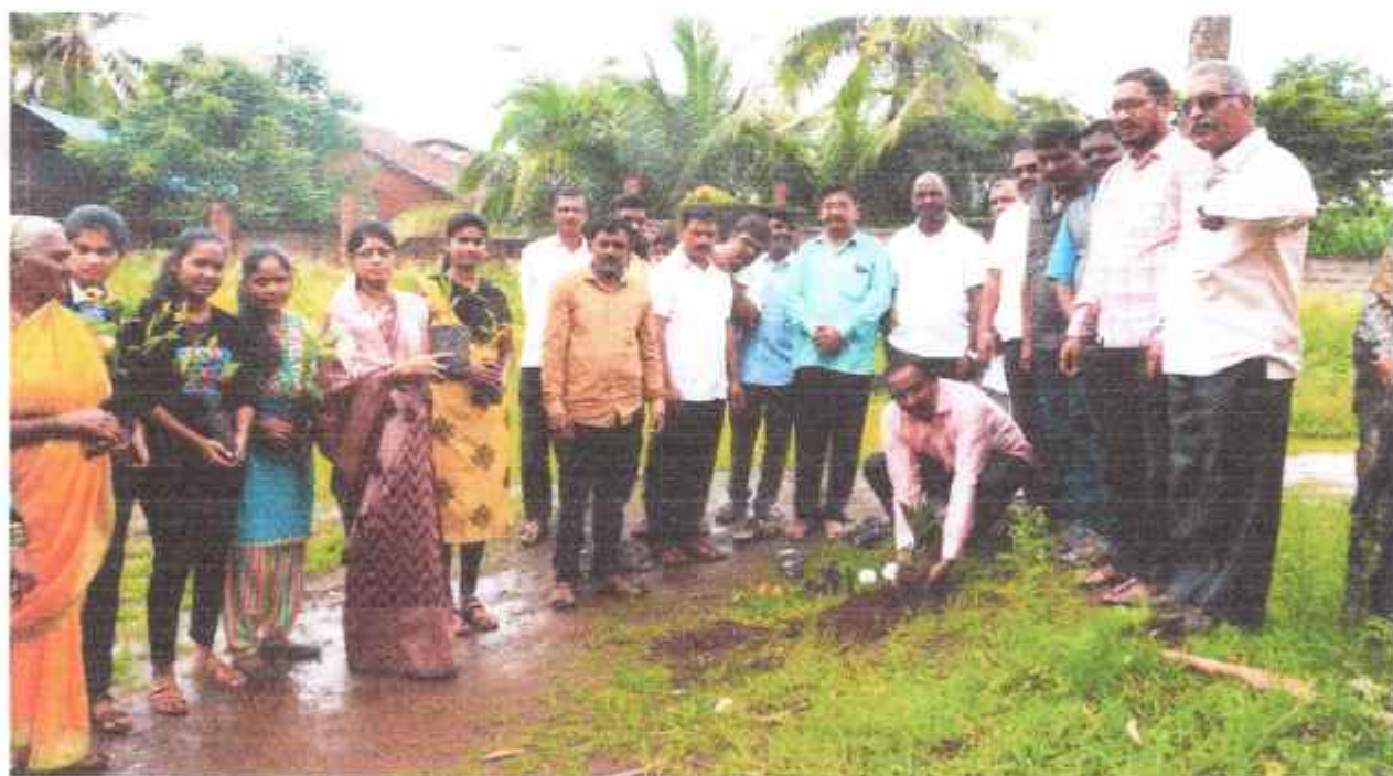
Some Photographs during Tree Plantation at Titave 18/July/2022