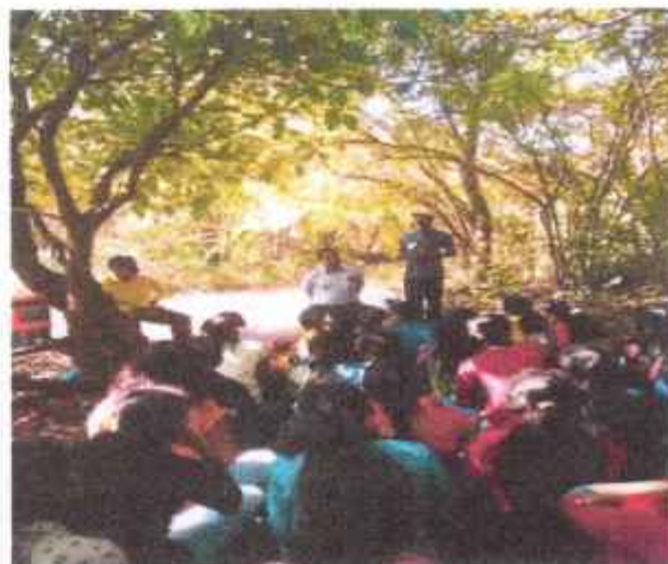
Caption – Some Photographs of the Field Visit